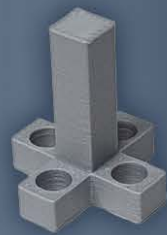
Assorted Corner Connectors